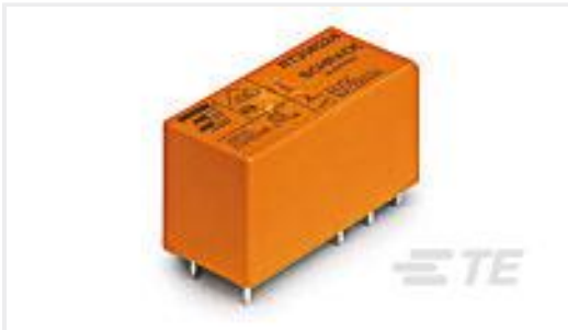
TE Part #4-1393240-8 RT334024