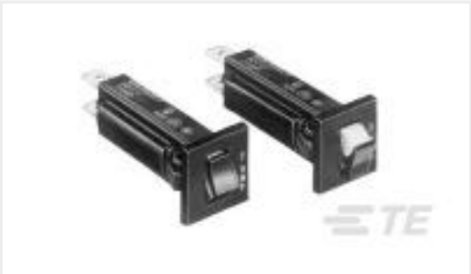
TE Part #3-1393250-1 W28-XQ1A-16=W28