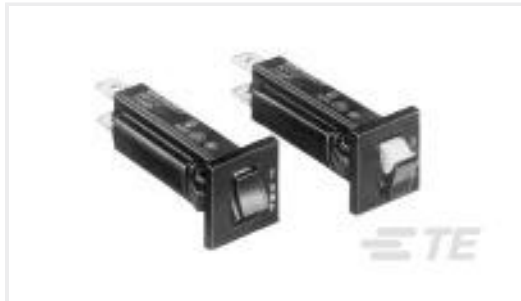
TE Part #2-1393250-5 W28-XQ1A-10=W28-