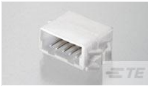
TE Part #292254-4 CT RELAY HDR ASSY 4P NAT