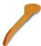
Alignment tool for cable markers, orange, Mounting type: slide on, Cable diameter: 2.9-3.6 mm

Alignment tool for cable markers - UC-WMCO 3,6 TOOL - 0827804