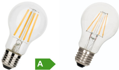
145687 LED FIL XTRA A60 E27 4W (60W) 840lm 830 Clear Class A