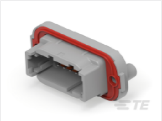
TE Part #DTM13-12PA HDR, 12P, GRY, RA, SN/NI/CU, A