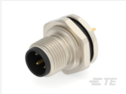
TE Part #T4140012041-000 M12, REAR MOUNTING, MALE, A CODE, 4P