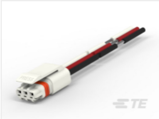
TE Part # 1-2834182-2 3P, PLUG CABLE ASSY-200MM, WHITE, TIN