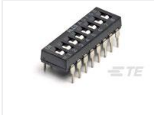
TE Part #2-1825059-4 ADF05STTR04=DIP S, FLUSH, SMT-GW