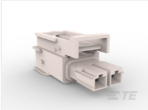
TE Part #1-2378159-2 Power Versa-Lock PLUG, 1X2 KEY A