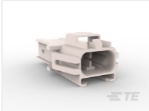
TE Part #1-2378158-2 Power Versa-Lock CAP, 1X2 KEY A