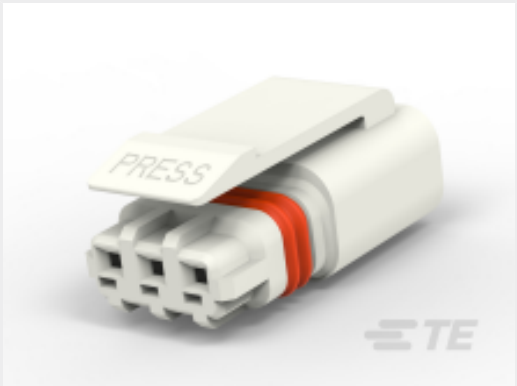
TE Part # 1-2834074-3 3P PLUG, MINIATURE WATERPROOF CONN, WHITE

requirements for substances in articles’ posted at this URL: https://echa.europa.eu/guidance-documents/guidance-on-reach