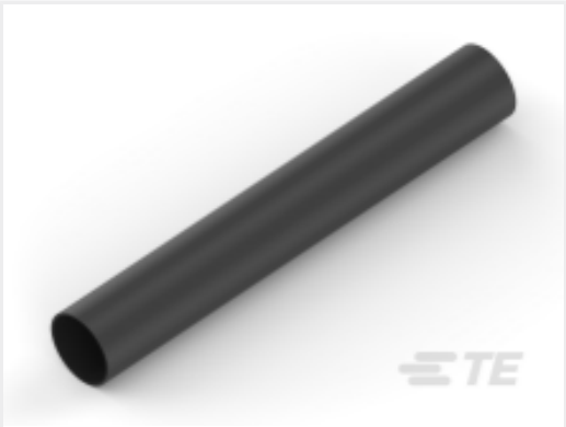
TE Part #NB14862001 DWP-125-1/4-0-STK