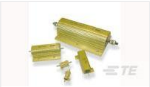
TE Part #9-1625971-3 HSA25 12R 5%