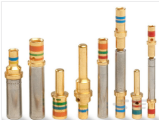
TE Part #0641-3-1231L CONT PIN