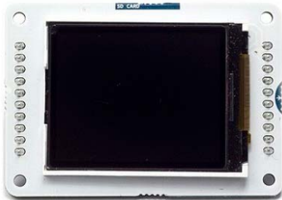
Arduino Graphic TFT Front