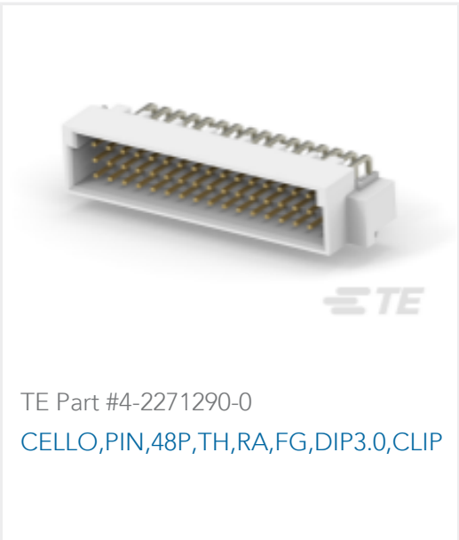
TE Part #4-2271290-0 CELLO,PIN,48P,TH,RA,FG,DIP3.0,CLIP