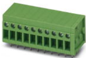
The illustration shows the 10-position version

Please be informed that the data shown in this PDF Document is generated from our Online Catalog. Please find the complete data in the user's documentation. Our General Terms of Use for Downloads are valid ( http://phoenixcontact.com/download )