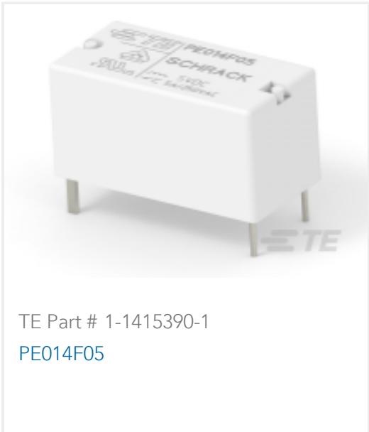
TE Part # 1-1415390-1 PE014F05