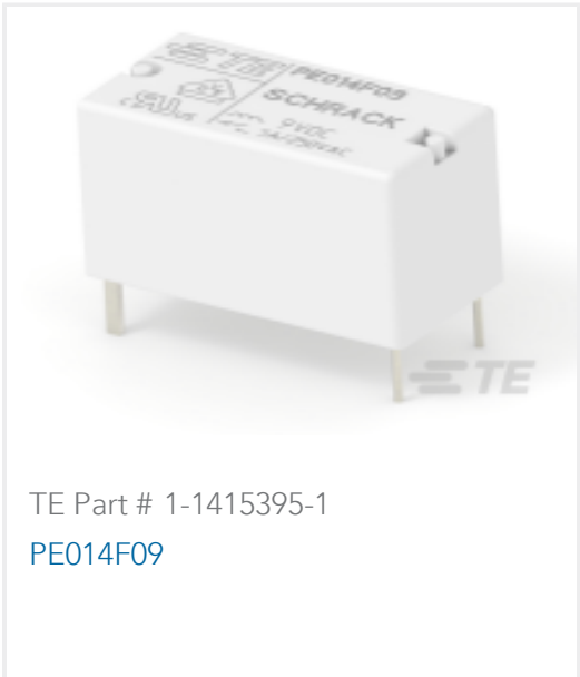
TE Part # 1-1415395-1 PE014F09