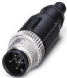
M12 blind plug for sensor circuit from PSR-CT safety circuits, pin 1 bridged to pins 2 and 4

Please be informed that the data shown in this PDF Document is generated from our Online Catalog. Please find the complete data in the user's documentation. Our General Terms of Use for Downloads are valid ( http://phoenixcontact.com/download )