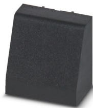
DIN rail housing, Filler plug for unoccupied terminal points (tall design), width: 21.35 mm, height: 19.65 mm, depth: 13.67 mm, color: black (similar RAL 9005)

Please be informed that the data shown in this PDF document is generated from our online catalog. Please find the complete data in the user documentation. Our general terms of use for downloads are valid.