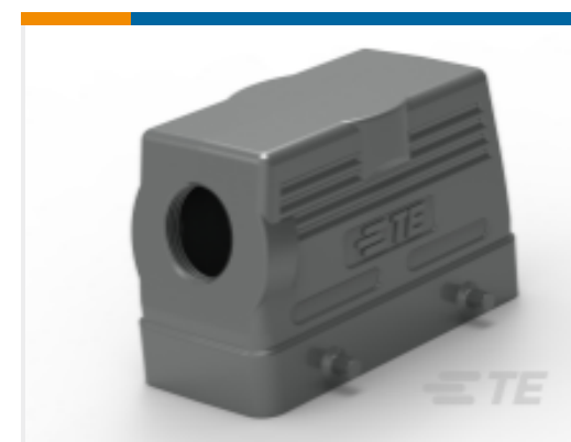
TE Model / Part # T1210160125-000 H16B-TS-M25