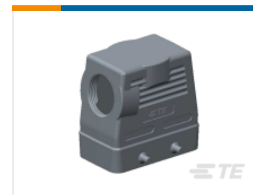
TE Model / Part # T1230160140-000 H16B-TSH-M40