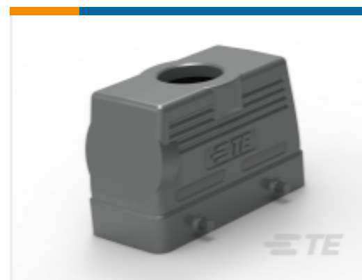
TE Model / Part # T1220160132-000 H16B-TG-M32