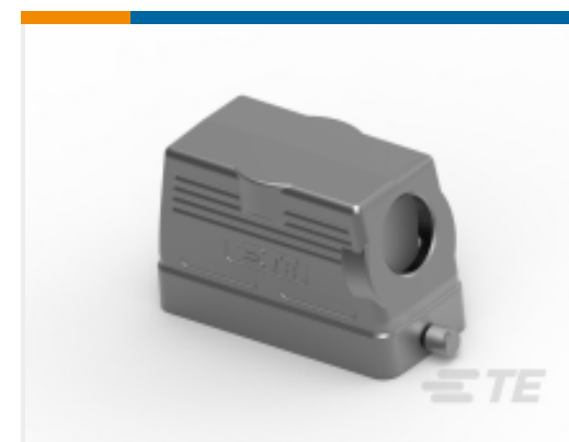
TE Model / Part # T1310160125-000 H16B-TS-RO-M25