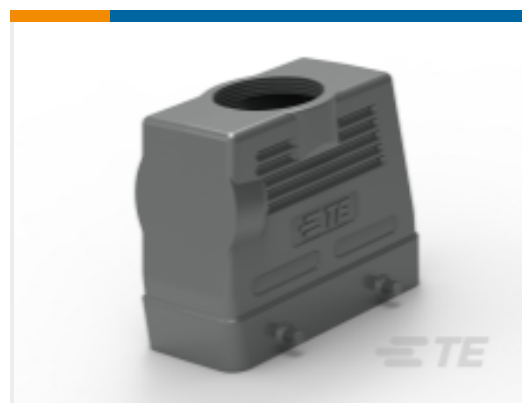
TE Model / Part # T1240160140-000 H16B-TGH-M40