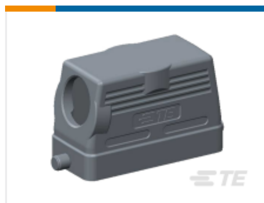
TE Model / Part # T1310160121-000 H16B-TS-RO-PG21