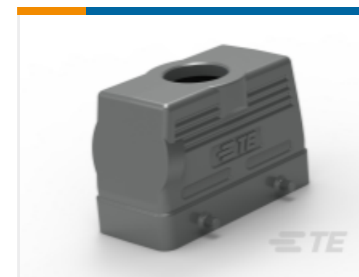
TE Model / Part # T1220160125-000 H16B-TG-M25