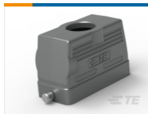
TE Model / Part # T1320160121-000 H16B-TG-RO-PG21