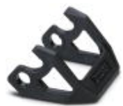
Replacement double locking latch for HEAVYCON EVO housing, HC-B10/HC-B16/HC-B24, PA

Double locking latch - HC-B10-24-DL-PLBK - 1407696