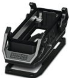
HEAVYCON EVO panel mounting base, plastic, B24, with double locking latch, height: 30.5 mm, with flat gasket

Please be informed that the data shown in this PDF Document is generated from our Online Catalog. Please find the complete data in the user's documentation. Our General Terms of Use for Downloads are valid ( http://phoenixcontact.com/download )