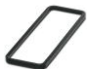
Profile gasket for HEAVYCON EVO supporting base element type B24

Profile gasket - HC-B24-SP-RBK - 1407709