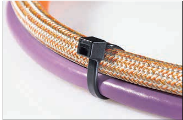
LK-Series – in-between size to T-Series.