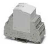
Plug-in device protection, according to type 3/class III, for 3-phase power supply networks with separate N and PE (5-conductor system: L1, L2, L3, N, PE), with integrated surge-proof fuse and remote indication contact.

Type 3 surge protection device - PLT-SEC-T3-3S-230-FM - 2905230