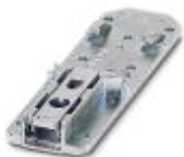
Universal DIN rail adapter

Assembly adapters - UTA 107/30 - 2320089