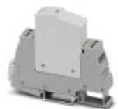
Type 3 surge protection, consisting of protective plug and base element, with integrated status indicator and remote signaling for single-phase power supply networks. Nominal voltage 24 V AC/DC.

Type 3 surge protection device - PLT-SEC-T3-24-FM-UT - 2907916