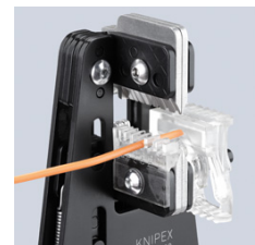
12 12 02 with cable guide and length stop