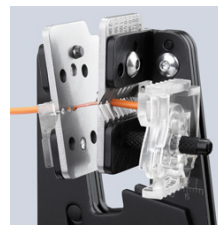
Positive stripping thanks to precise shape of the blades