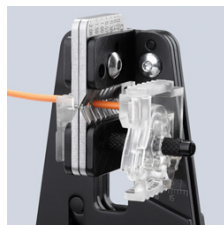
Precise cutting of the insulation to a complete extent