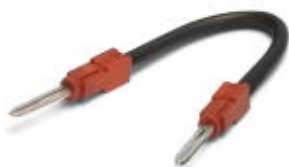
The figure shows the 60 mm version

Wire bridge, length: 250 mm, width: 5.1 mm, number of positions: 1, color: red/black