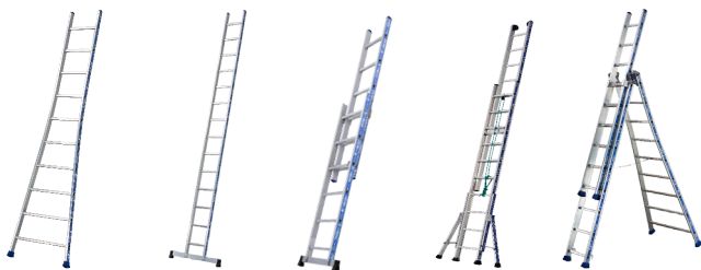
Single flared Single straight 2-section manual extension 2/3 section rope-operated Transformable