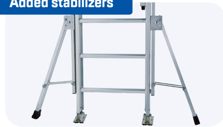
2/3 section rope-operated