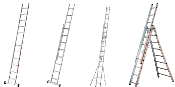
Single straight 2-section manual extension 2/3 section rope-operated Transformable