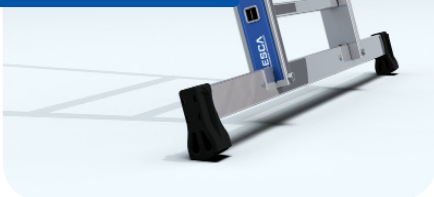
2-section manual extension

Addition of a base with reinforced footpads