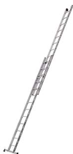
2/3 section rope-operated