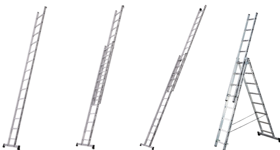
Single straight 2-section manual extension 2/3 section rope-operated Transformable