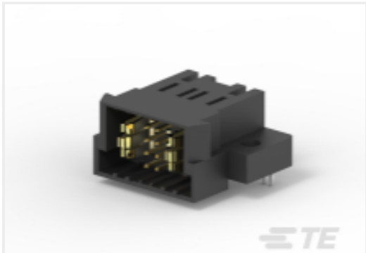
TE Part #6450834-1 MBXL R/A HDR STR 1P/8S/1P