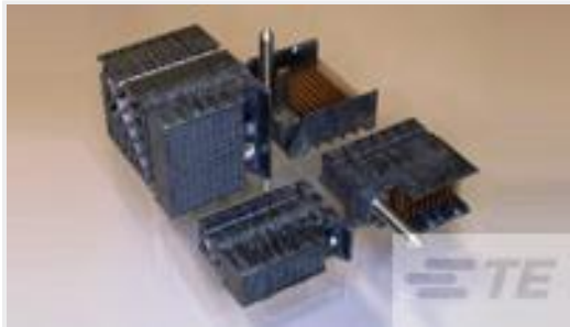
TE Part #2007850-1 IMP100S,H,V5P10C,UG,DEW46,4.5