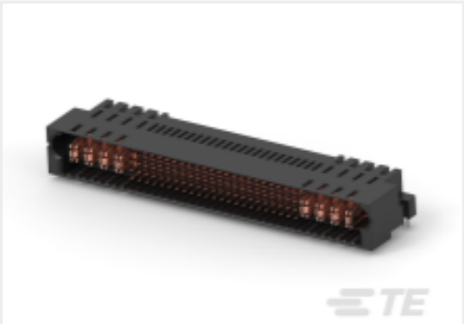
TE Part #2-2204910-5 MBXLE R/A HEADER 4HDP + 92S + 4HDP