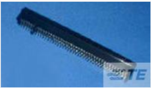
TE Part #2-1734774-1 PCI EXP 3.1L 98 POS WHT 30u"