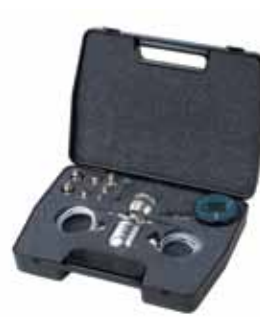
Low pressure pneumatic test kit

Includes: DPI 104; ranges to 30 psi (2 bar), PV 210 low pressure pneumatic test pump, hose, adaptors, seal kit and case.