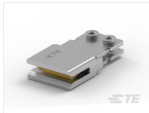
TE Part # 2204761-2 IN-LINE MOUNT 300A BUSBAR CONN