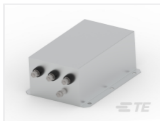
TE Part #801035-SF FN3359-250-28