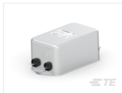
TE Part #800621-SF FN2060-20-08