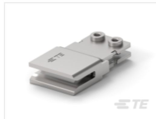
TE Part # 2204761-1 IN-LINE MOUNT 300A BUSBAR CONN.