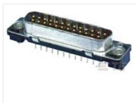
TE Part #1-338311-2 25POS.HD20 PLUG ASS