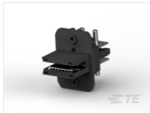
TE Part # 2204866-1 RACK 500A (250+250) ORV2 Output Conn