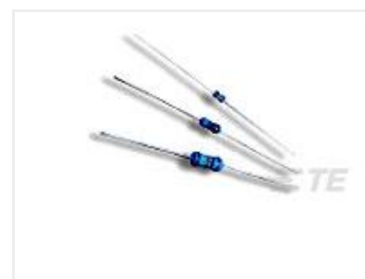
TE Part #1622479-1 LR1 1% 43K