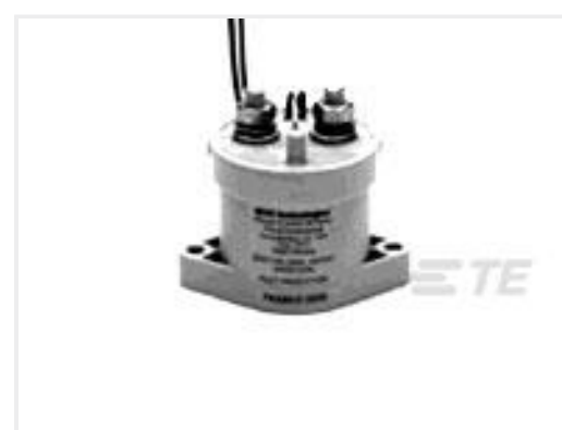
TE Part #4-1618387-1 EV200HRANA=RELAY, SPST-NO