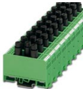
Fuse module, for 3 cartridge fuse inserts, 5 x 20 mm, individual connection

Please be informed that the data shown in this PDF Document is generated from our Online Catalog. Please find the complete data in the user's documentation. Our General Terms of Use for Downloads are valid ( http://download.phoenixcontact.com )