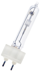
143472 TUN CMH-T G12 35W 942 15000h