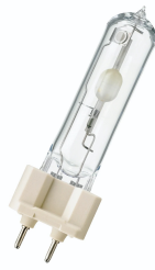
60100131518 MASTERC CDM-T Elite 35W/942 G12