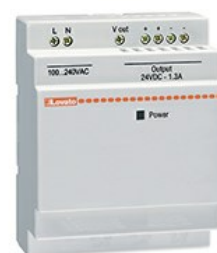
Power supply unit 100... 240VAC/24VDC 1.3A LRX1V3D024