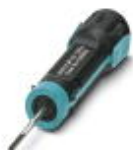
Assembly tool, for CK 1.6... crimp contacts for small conductor cross sections

Assembly tool - UNIFOX MT-CK 1.6/2.5 - 1089092