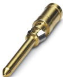
Turned 1.6 crimp contact, individual male contact, core diameter 2.5 mm 2 , gold-plated

Please be informed that the data shown in this PDF Document is generated from our Online Catalog. Please find the complete data in the user's documentation. Our General Terms of Use for Downloads are valid ( http://phoenixcontact.com/download )