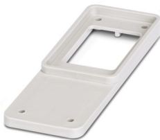
HEAVYCON adapter plate, type B24 on B6, for panel cutouts of type B24, gray

Please be informed that the data shown in this PDF document is generated from our online catalog. Please find the complete data in the user documentation. Our general terms of use for downloads are valid.