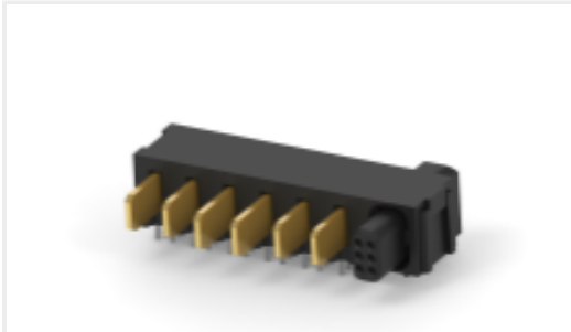
TE Part #6651678-1 279-1133-10200A=TA CONN,SKT, FLATPAQ