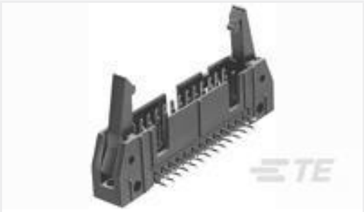
TE Part #1-499786-0 050 UNIV HDR RA 4S 15DP STD L1