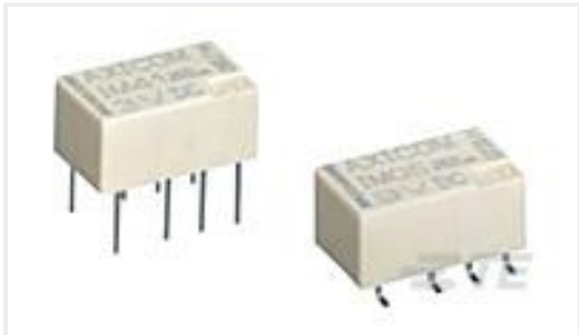
TE Part #6-1462037-7 IM46GR=IM RELAY 100mW 12V BIS