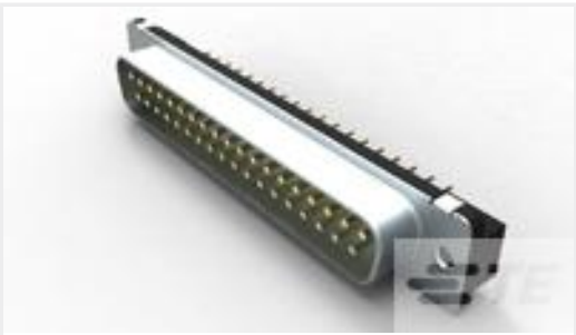
TE Part #5747375-8 37 PLUG SP/FMS INSRT