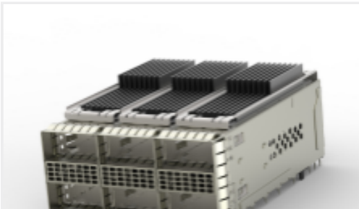
TE Part #2299924-3 ZQSFP+ STACKED REC ASSEMBLY 2X3, HS