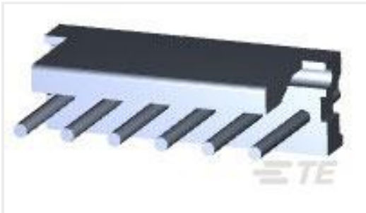
TE Part #640388-6 06P MTA156 HDR ASSY RN STR F/L