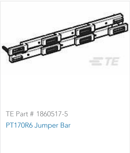
TE Part # 1860517-5 PT170R6 Jumper Bar