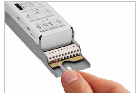
Inserting solid conductor via push-in termination.