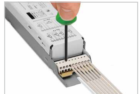
Removing conductor via 1.0 mm Ø disconnection tool. (206-841)