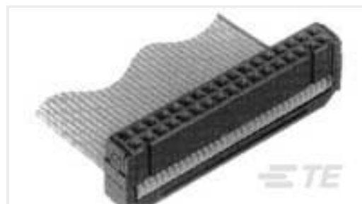
TE Part #1658623-2 14 NOVO MIL 30DP, LEAD FREE