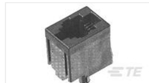
TE Part #5520257-2 MJ,TE,4P,PNL STOPS