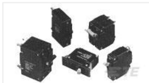
TE Part #5-1393252-8 W67-X2Q12-20=M6/M7/M9/W6/W7