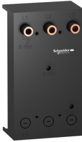
PLATE GV7/NSX 100-250 3P 106X192 IEC/UL FOR 60 BUSBAR INTERAXIS