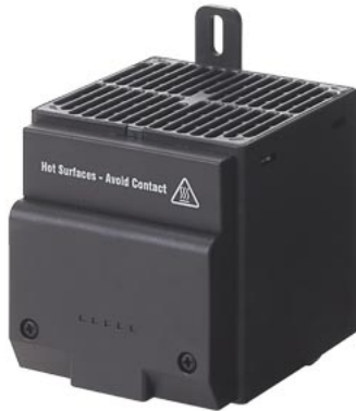
Semiconductor heater unit CSL 028 250 W, 230 V AC Screw mounting