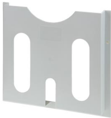
Circuit diagram pocket, 30 mm deep for DIN A4 upright, self-adhesive