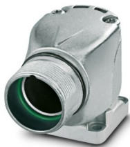
Housing for circular connector, series: RC, angled rotatable, Screw locking mechanism, M23, Axial O-ring, shielded: yes

Please be informed that the data shown in this PDF document is generated from our online catalog. Please find the complete data in the user documentation. Our general terms of use for downloads are valid.