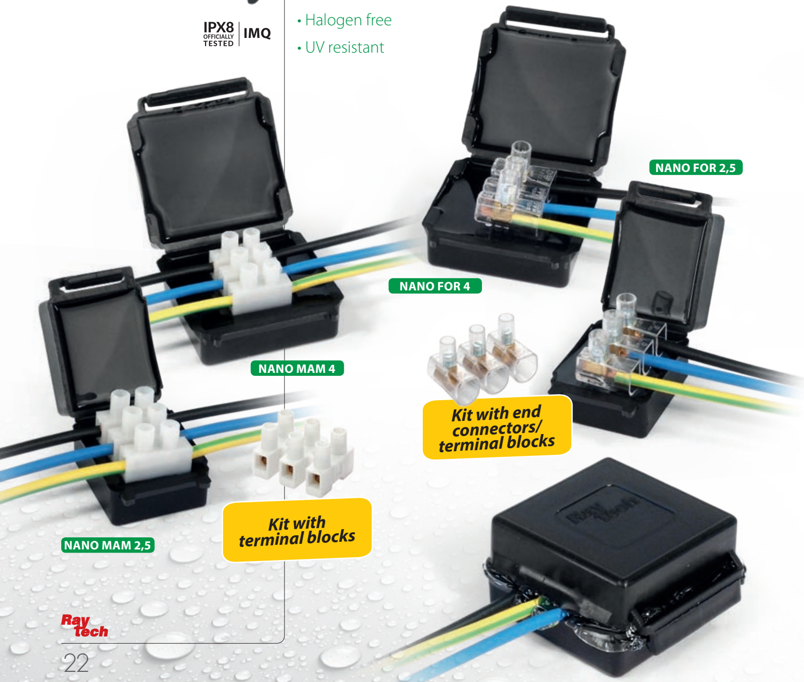
NANO FOR 2,5