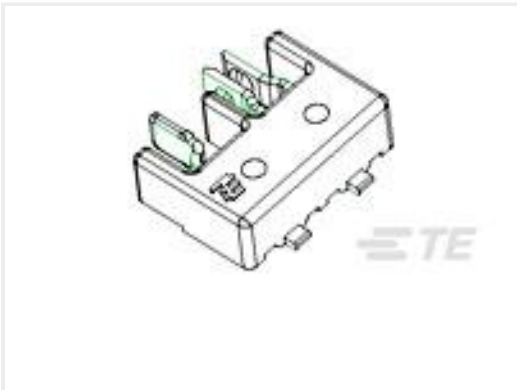
TE Part #1971567-2 MINIATURE HERMAPHRODITIC (4P)