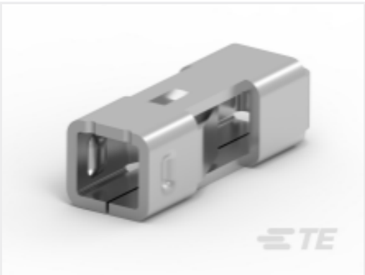
TE Part #2834171-3 ULTRAMINIATURE SLIM CONTACT