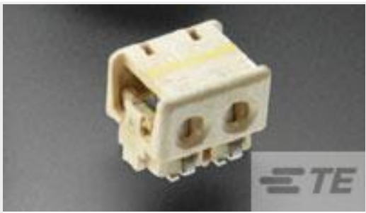
TE Part #2106431-2 Connector, SMT-IDC PASS THRU, 2 POS, 18