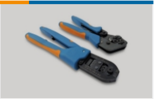
Hand Crimping Tools(2)