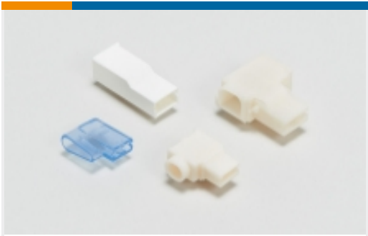
Crimp Terminal Housings(1)