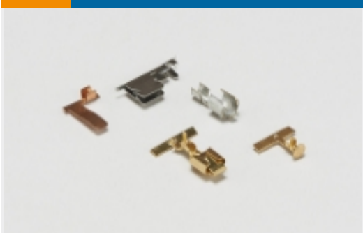
Special Purpose Terminals(1)