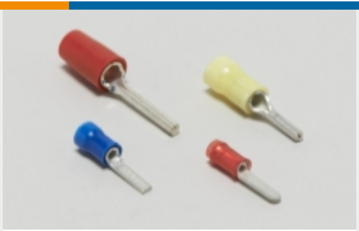
Crimp Wire Pins, Tabs & Ferrules(41)