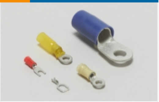
Ring Terminals & Spade Terminals(861)