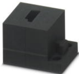
Small, slotted cable sleeves suitable for one AS-i cable, material: NBR, version: left

Please be informed that the data shown in this PDF Document is generated from our Online Catalog. Please find the complete data in the user's documentation. Our General Terms of Use for Downloads are valid ( http://phoenixcontact.com/download )