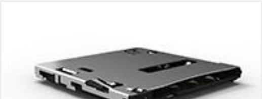
TE Part #2174803-2 PUSH-PUSH MICRO SIM CONNECTOR