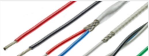
TE Part #5042433001 FLT0111-1.50-0