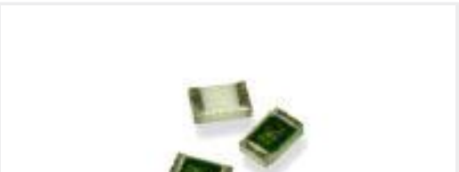
TE Part #1879417-6 CPF0603 820K 0.1% 25PPM 5K RL