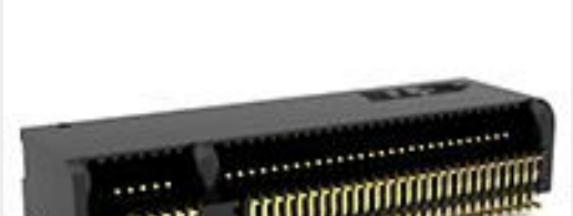
TE Part #1-2199230-6 M.2 0.5PITCH 4.2H KEY M 30U AU