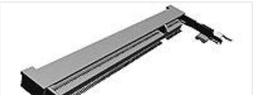
TE Part #1473005-1 SEMI HARD TRAY DDR SOCKET 200P