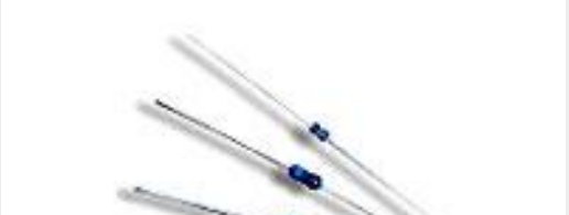
TE Part #1622302-1 LR1 1% 10R