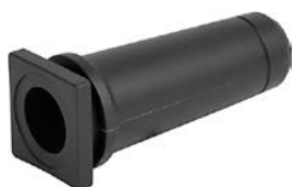
Cable Guard KT14 PVC Cable Guard for rewireable connectors