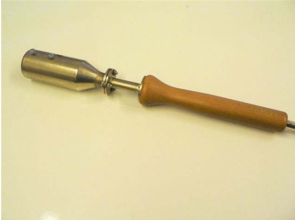
Iron featured without bit