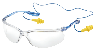
3M™ Tora™ CCS Safety Spectacles

PC = Polycarbonate AS = Anti-scratch AF = Anti-fog