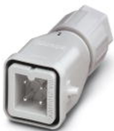
HEAVYCON QUICKON sleeve housing A3, for single locking latch, 3-pos., with PE connection, plug, QUICKON connection, straight cable outlet

Please be informed that the data shown in this PDF Document is generated from our Online Catalog. Please find the complete data in the user's documentation. Our General Terms of Use for Downloads are valid ( http://phoenixcontact.com/download )