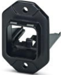
RJ45 panel mounting frame, IP67, for push-pull interlocking, plastic, with the Freenet system, for square panel cutout, with grommet, without mounting screws

Please be informed that the data shown in this PDF Document is generated from our Online Catalog. Please find the complete data in the user's documentation. Our General Terms of Use for Downloads are valid ( http://phoenixcontact.com/download )