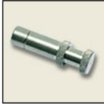
3626 BLANKING PLUG