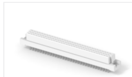
TE Part #4-2271014-0 CELLO,REC,96P,TH,V,FG,DIP3.0,-