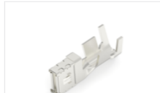
TE Part #2373747-5 DYNAMIC D8000 REC CONT SILVER