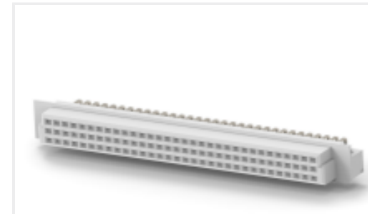
TE Part #4-2834379-0 CELLO,REC,96P,TH,RA,FG,DIP3.0,