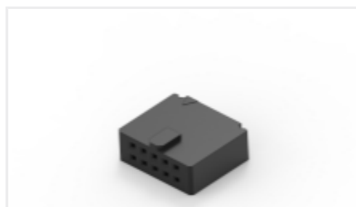
TE Part #1-2271875-0 EJT2.54,REC HSG,2x5P