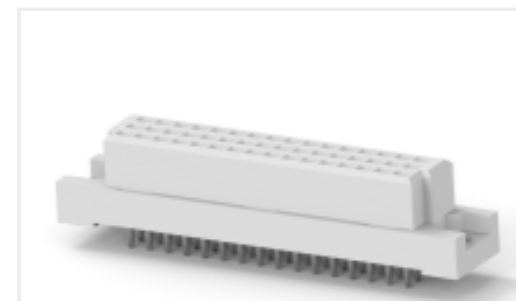
TE Part #4-2271908-0 CELLO,REC,48P,TH,V,FG,DIP3.0,-