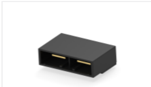
TE Part #1-2351965-2 Dynamic D8000 HDR ASSY 2PX BLK