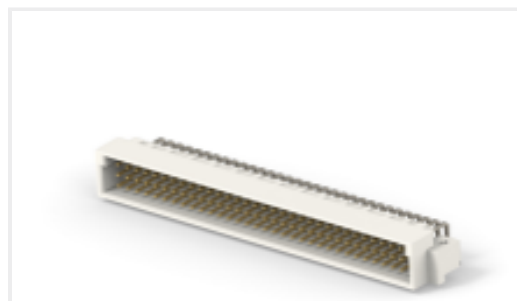
TE Part #4-2271013-0 CELLO,PIN,96P,TH,RA,FG,DIP3.0,-