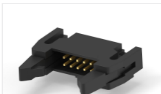
TE Part #1-2271038-0 EJT2.54,HDR,2x5P,RA,THT,FG