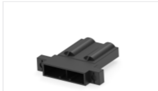
TE Part #1-2352216-2 DYNAMIC D8000 TAB HSG 2P