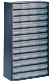
Storage Cabinets System 150

You can combine the cabinets with raaco's tool panels and storage boxes, to create a comprehensive system that you can expand as required. Choose between stationary and mobile solutions.