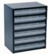
Storage Cabinets System 250