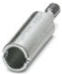
Coding socket for coding up to 16 connectors