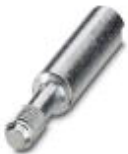
Coding peg for coding up to 16 connectors