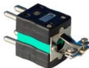
Standard Duplex clamp when fitted