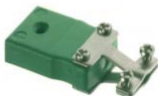
Miniature clamp when fitted