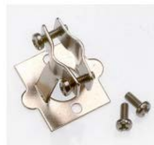
Standard (Duplex) Clamp