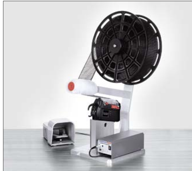
Bench mount kit CPK with foot pedal (also shown: Autotool 2000 CPK, Power pack CPK and T18RA3500).