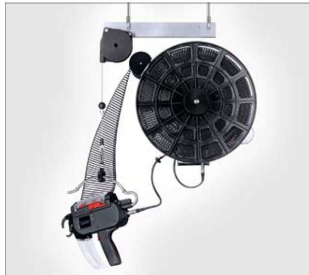
Overhead suspension CPK (also shown: Autotool 2000 CPK, Power pack CPK and T18RA3500).