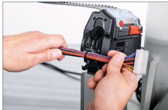
Application with the Bench mount kit CPK.